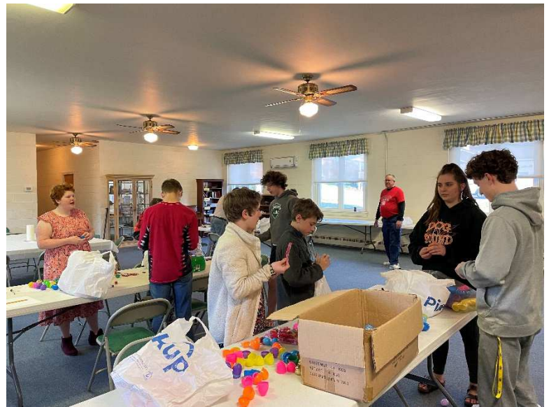
Youth Working Together to Fill Easter Eggs