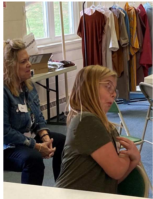
And time for some old-fashioned silliness!