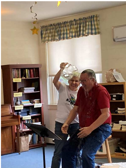
A lesson on fear (using the fear of water as an example!!)