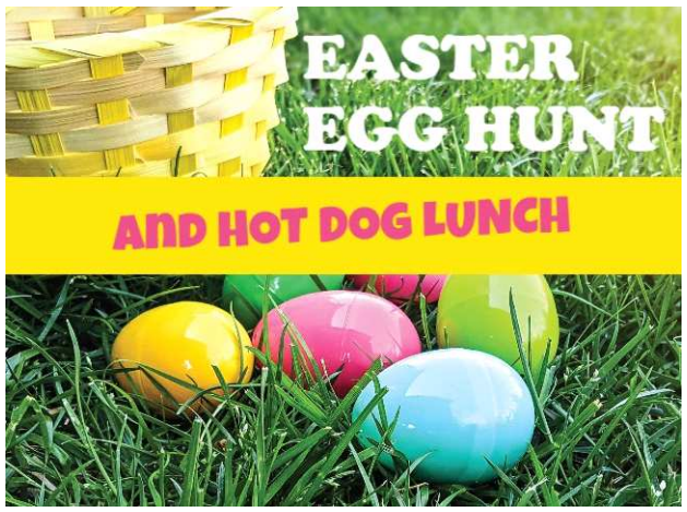
Saturday, April 8 11:00 am Mount Pleasant Baptist Church

CarilionClinic.org/calendar for a full schedule.